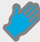
Safety Supplies & PPE