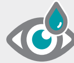
AEDs & Emergency