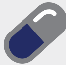
First Aid Supplies

Incidents can happen during the workday. Let Cintas help keep you and your employees ready™ — with leading first aid and safety products and services that help you maintain a safe workplace.